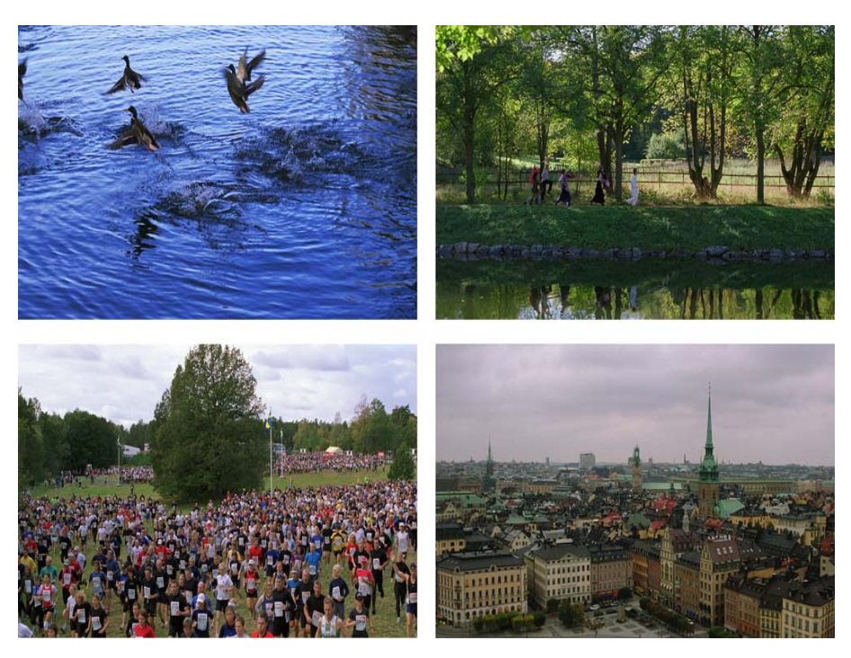
Figure 1: Sample frames of the four HDTV video sequences used for testing purposes.

ming platform. These two are the implementation strategies that we tested and benchmarked in this work.