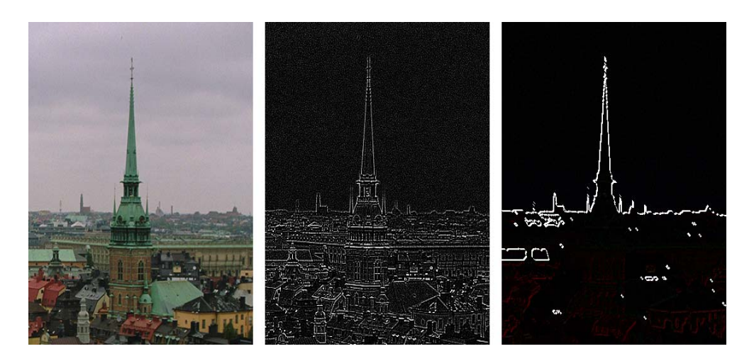
Figure 2: A frame and the processing result after border detection, and after a pipeline of operations.